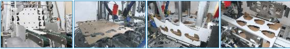
blank magazine mechanical blank picker blank folding ready tray